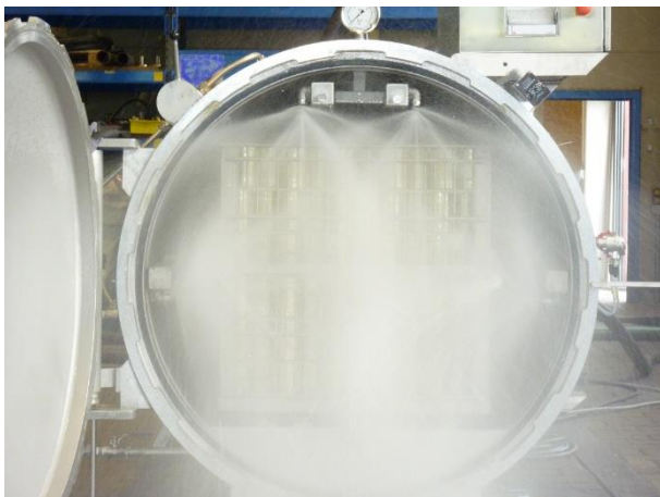
Retort spray system – Type DAX1100-4 BV-VA-WT

As business was growing, Burns Pet Nutrition decided to buy another retort in 2014. This time it was a static steam-water-spray unit, which isn't as flexible when it comes to the range of products, but even more economical. This is possible because you can produce the same number of products in a smaller vessel, which means even less water and steam consumption.