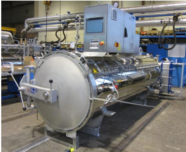
dft technology retort – Type DAX1100-4 BV-VA-WT

While the steam-water-spray retort is already a very economical solution for pasteurization, or in this case sterilization of pet food, Burns Pet Nutrition even further optimised the efficiency of their retort.